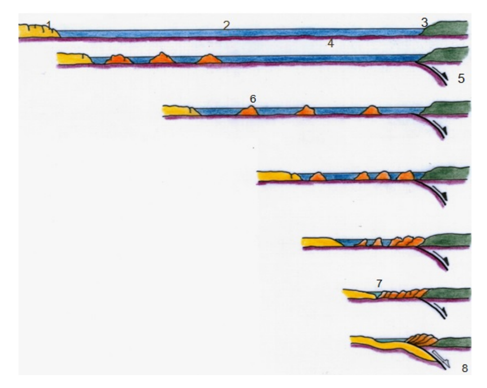
Fig. 1. Stages from the closing of the Tethys Ocean and transcontinental collision between Gondwana and Neo Europe. 1- Gondwana continental massif, 2- Tethys Ocean, 3- Paleo Europe continental massif, 4- oceanic crust, 5- Phanerozoic subduction of the Tethys Ocean beneath the Paleo Europe continental massif, 6- fragments from the Gondwana's continental crust in the Tethys Ocean, 7- Mediterranean Sea building (after the closing of Tethys Ocean), 8- transcontinental collision between the Gondwana and the Neo Europe continental massifs ( Tzankov, Iliev , 2015).

The Rhodope Mountain is located in the eastern part of the Balkan Peninsula. Its surveyed parts are made of multiple tectonic microplates (Bulgarian, Moesian, Halkidiki, Pontic, etc.). These continental microplates are separated from Gondwana's passive paleotethysian margin at different stages in its Phanerozoic evolution. During the closure of Tethys Ocean (Fig.1) they moved in north direction in the form of islands or archipelagos, which have different geological and tectonic history. Those Gondwana's continental fragments reach the southern edge of the paleo European continental massif at the end of subduction of the Tethys' oceanic crust. They are tectonically articulated and build up the recent northwestern and southern edge of the European continent- Neo Europe. These circumstances determine the mosaic nature of continental crust in the region. ( Tzankov, Iliev , 2015)